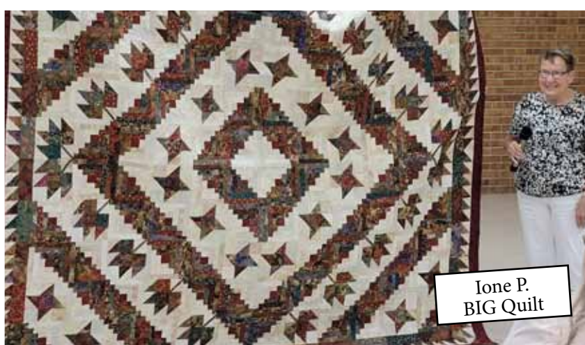
Ione P. BIG Quilt