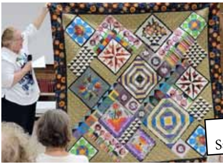
Gale D. Sampler Quilt and back