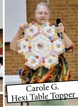
Carole G. Hexi Table Topper