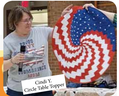
Cindi Y. Circle Table Topper