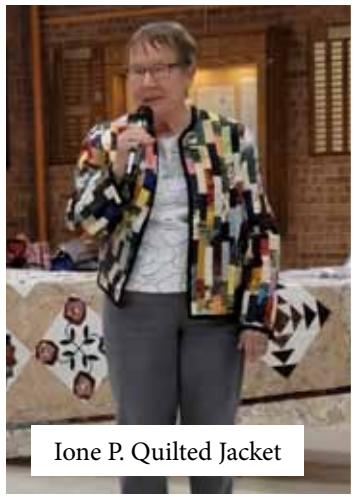
Ione P. Quilted Jacket