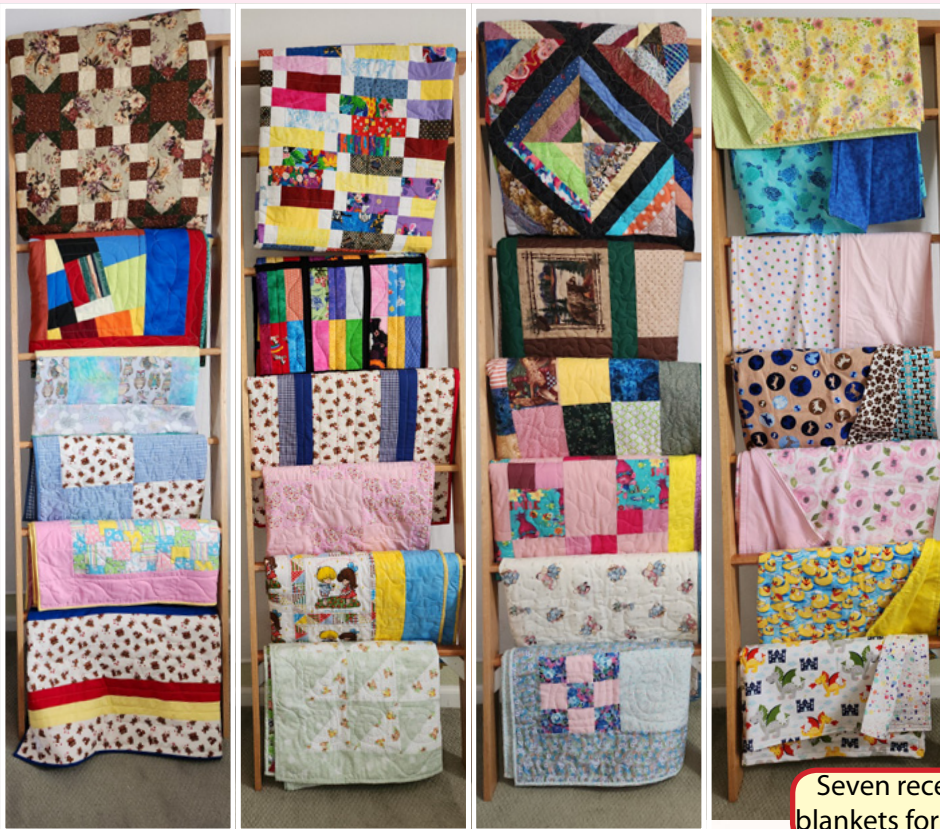
Seven receiving blankets for newborns.

Our members have been busily making new quilts for our donations. Thanks for all you do each month.