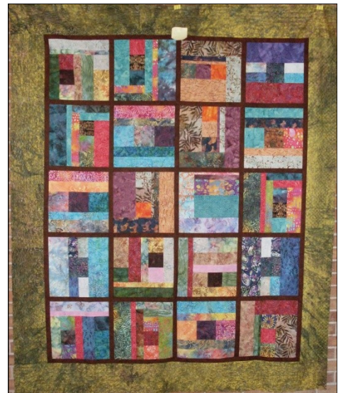
CHQ 2012 Raffle Quilt top/back