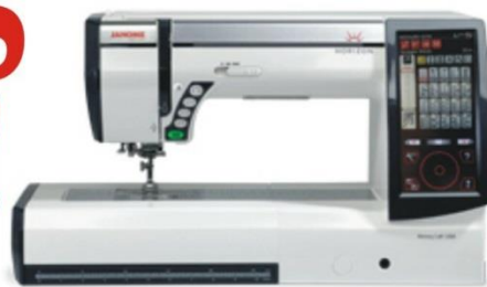
Memory Craft 8900 QCP Memory Craft 8200 QC