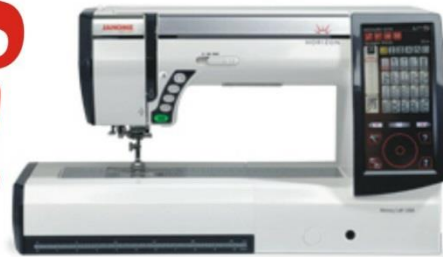
Memory Craft 8900 QCP Memory Craft 8200 QC