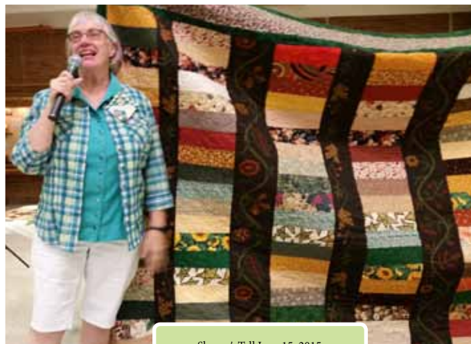
Show & Tell June 15, 2015