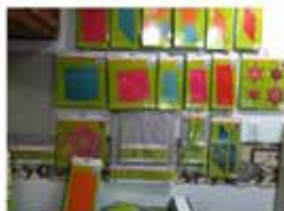
My Accuquilt Studio Corner