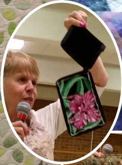
Show & Tell May 18, 2015