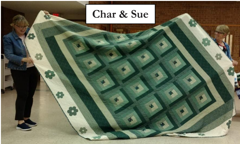
Char & Sue