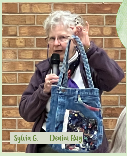
Sylvia G. Denim Bag