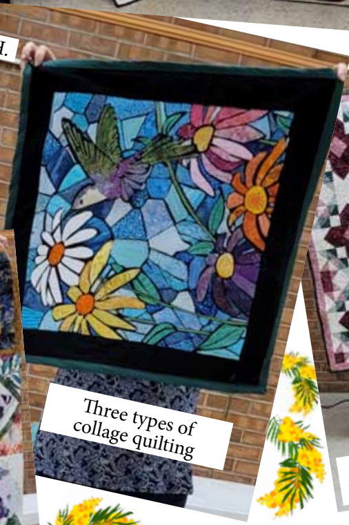
Three types of collage quilting