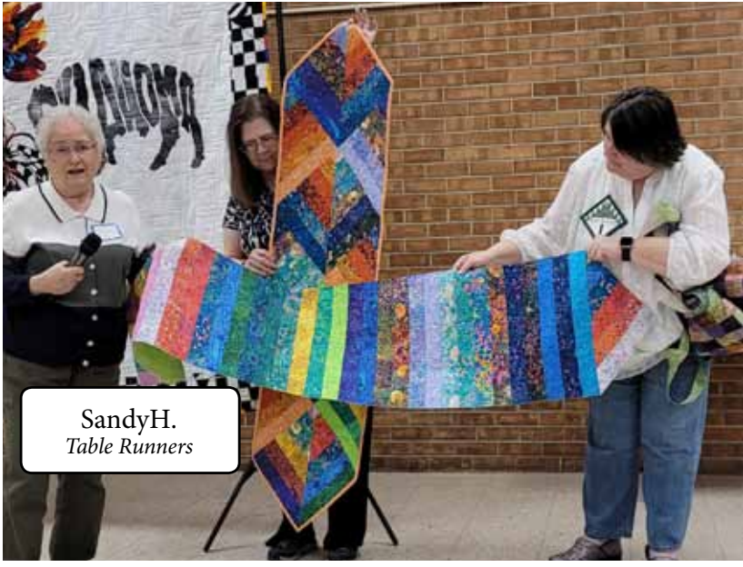
Sandy H. Table Runners