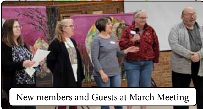
New members and Guests at March Meeting

We don't have a librarian yet this year, so if you are interested in volunteering, please let our president know. And we can always use help at the end of a meeting putting the carts away.