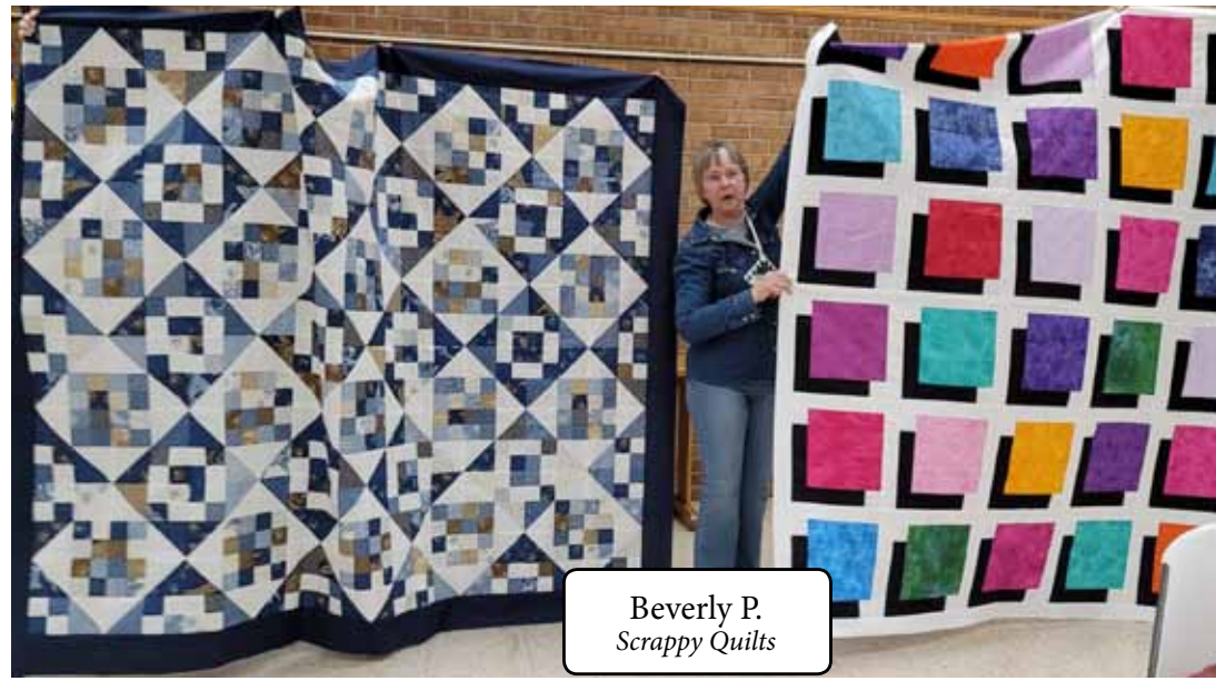
Beverly P. Scrappy Quilts