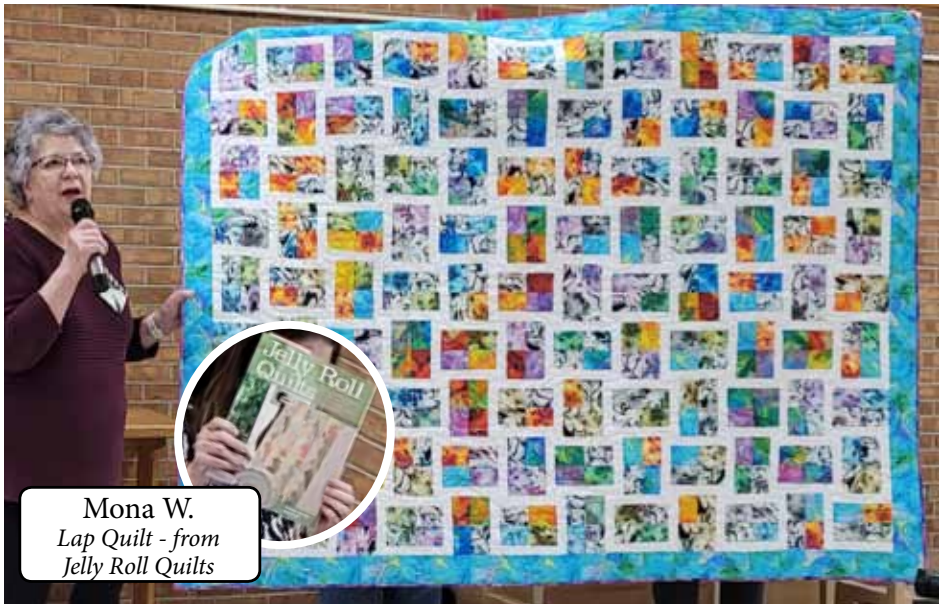
Mona W. Lap Quilt - from Jelly Roll Quilts