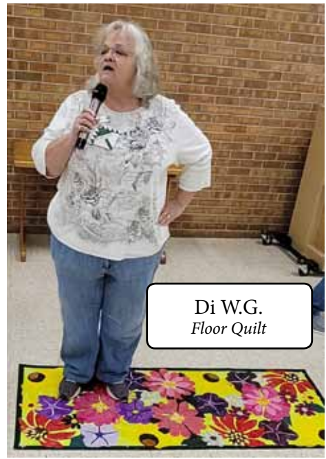
Di W.G. Floor Quilt