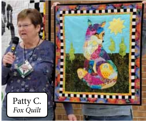
Patty C. Fox Quilt