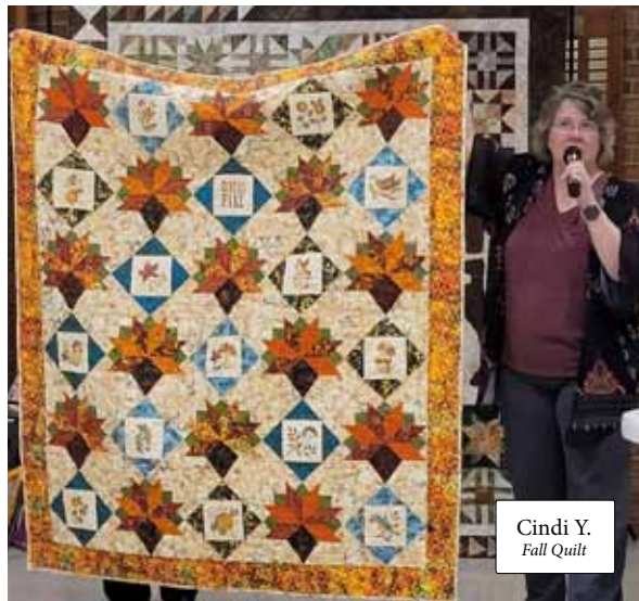
Cindi Y. Fall Quilt