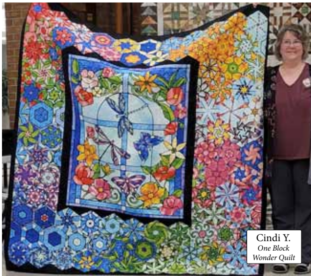
Cindi Y. One Block Wonder Quilt