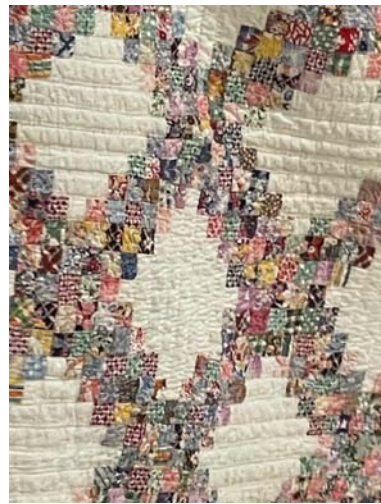
Irish Chain Quilt