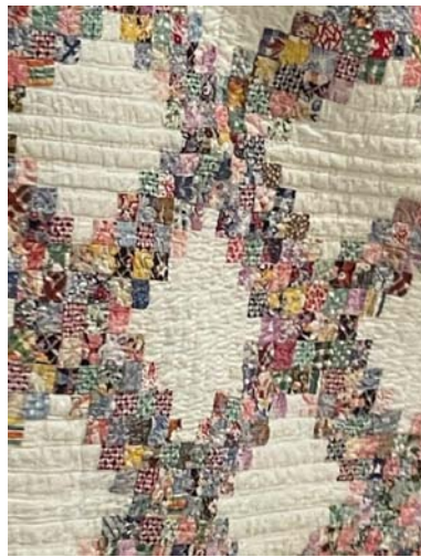
Irish Chain Quilt