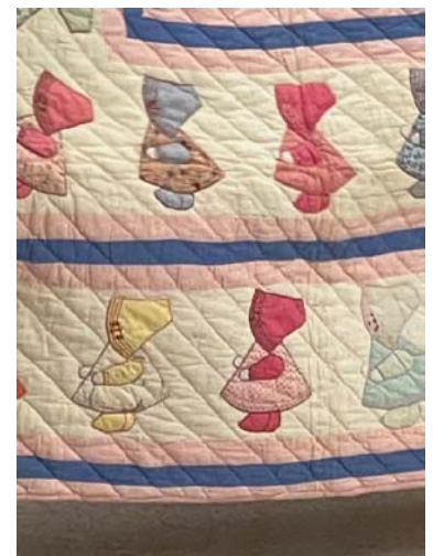
Sunbonnet Sue Quilt